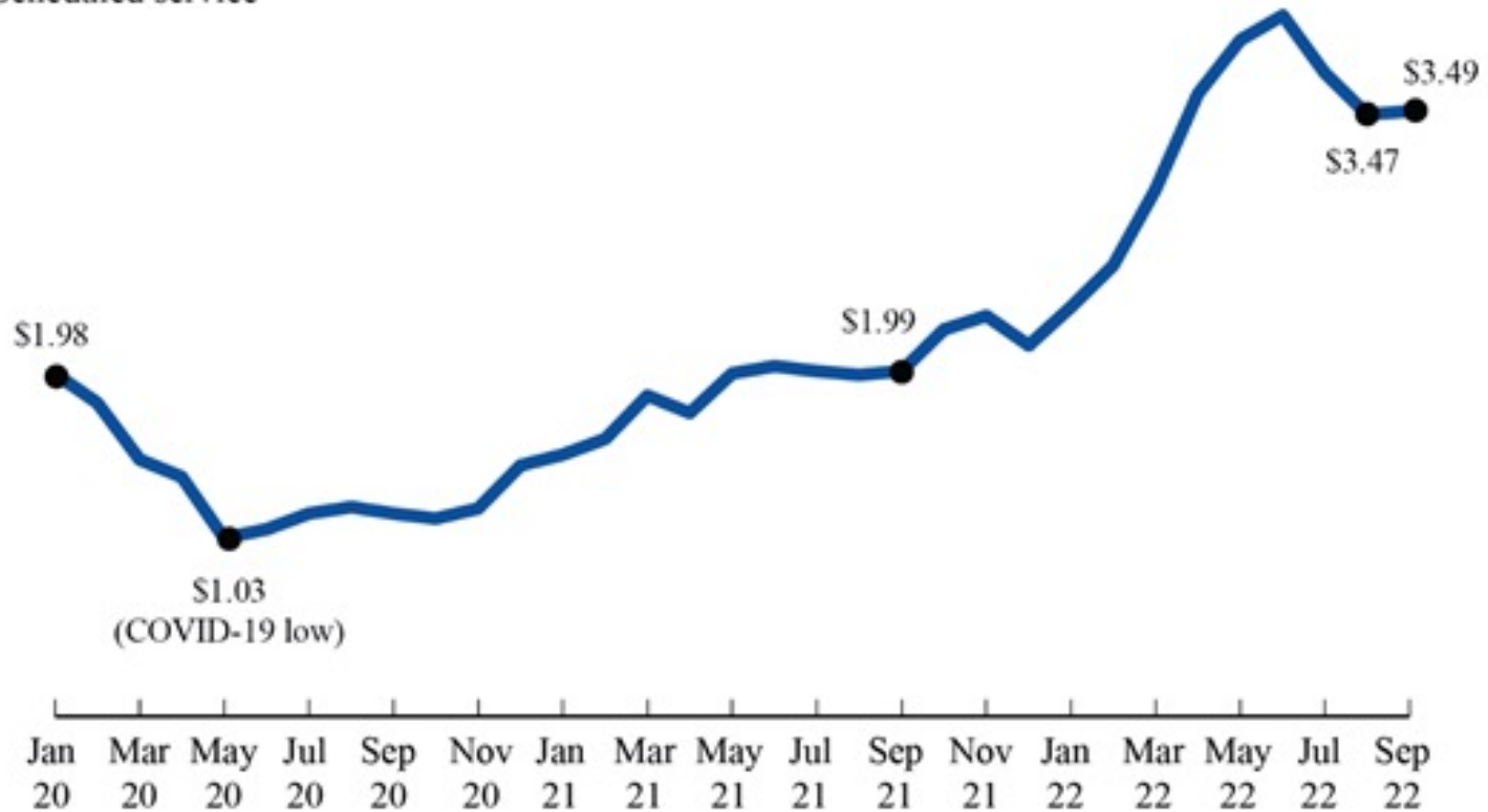
U.S. Airlines Fuel Cost Per Gallon Scheduled service